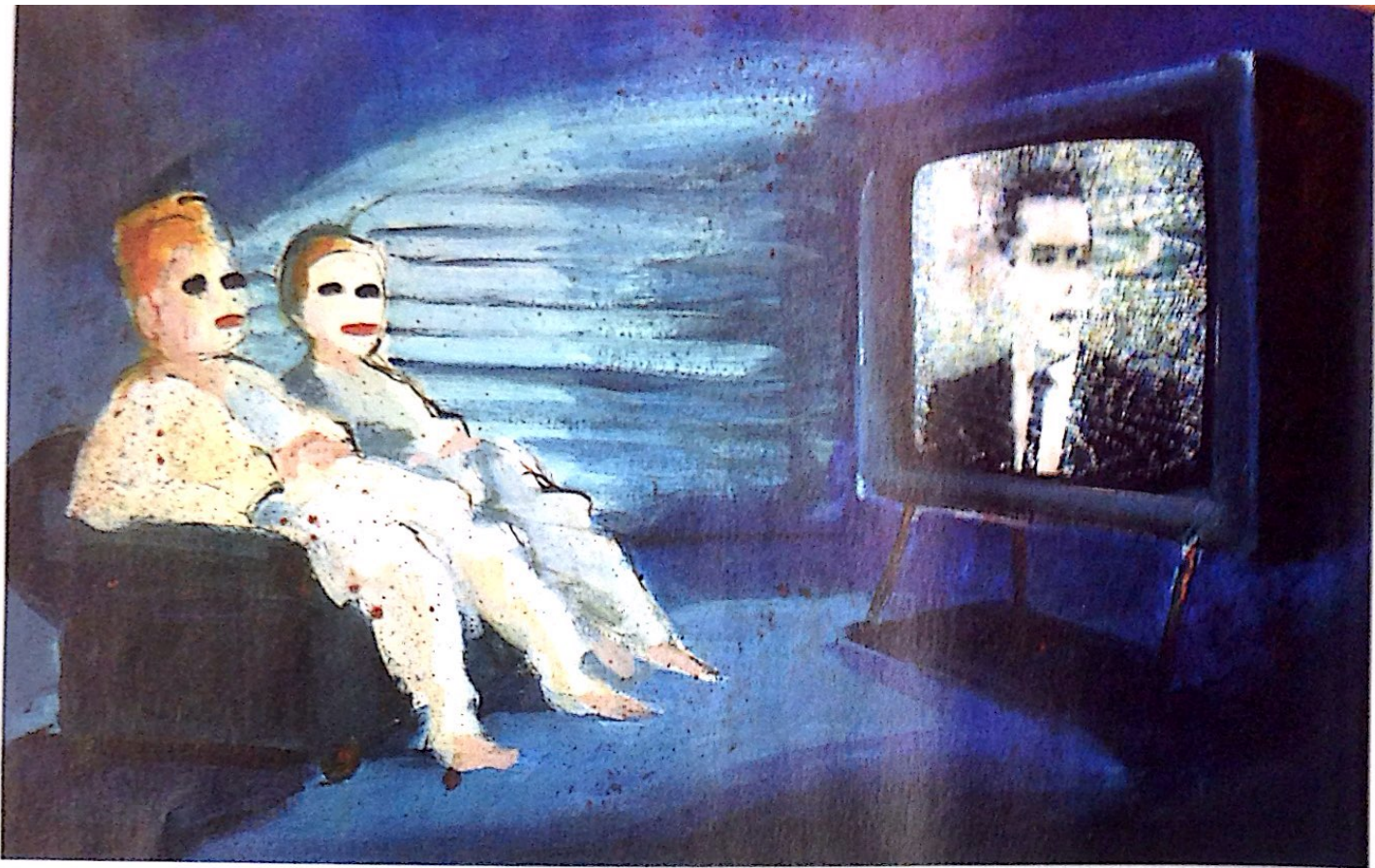
TVTime 2 (2002), Charles Foster-Hall. Acrylic on canvas, 16" × 28". © Charles Foster-Hall.

110 picture showed the full length of Harrison against a background calibrated in feet and inches. He was exactly seven feet tall.